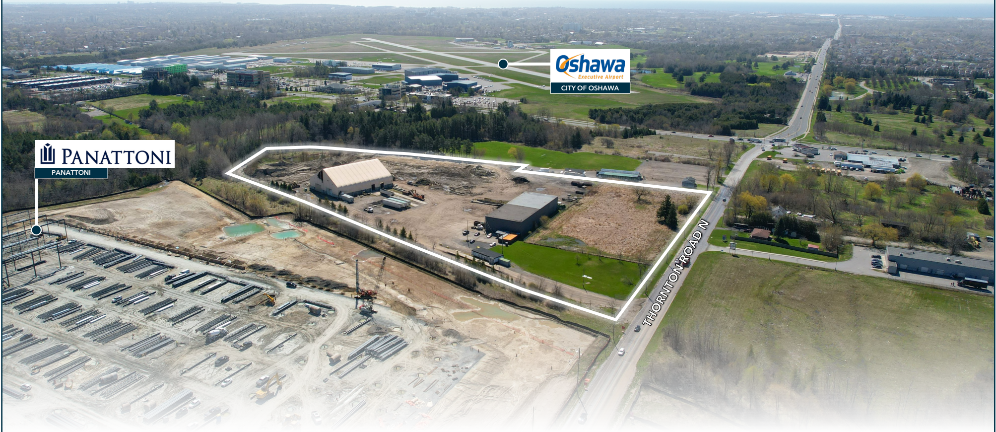
AERIAL FACING SOUTHEAST