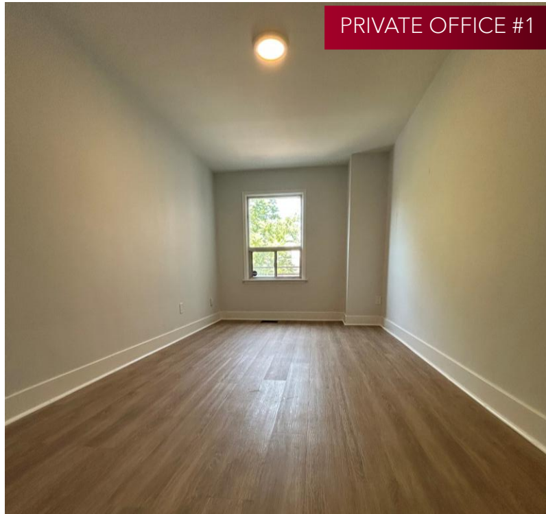
PRIVATE OFFICE #1