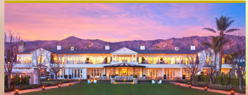
Rosewood Miramar Hotel (1.3 Miles from Subject Property) Opened in 2019 on Miramar Beach in Montecito, the all-new Rosewood Miramar luxury resort built by world renowned developer Rick Caruso. The property boasts elegant rooms and opulent suites in Montecito’s beachside haven.

Montecito is home to many world class restaurants and shopping as well some of Santa Barbara’s most stunning stretches of coastline and mountainous trailheads. It encompasses a total of eight square miles and comprises the Upper and Lower villages. The Mediterranean-style architecture, beautiful scenery and year-round sunshine is about as idyllic as you can get. It is conveniently situated five-minutes from downtown Santa Barbara and Los Angeles is about an hour by car. Travel + Leisure magazine named Montecito one of “its 50 Best Places to Travel in 2019.”